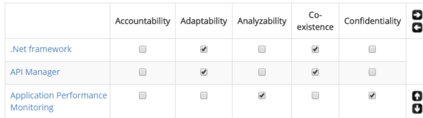
Fig. 2. A part of the mapping between the ISO/IEC 25010 and CSP features.

The DSST uses the ISO/IEC 25010 standard [4] and extended ISO/IEC 9126 standard [5], which are domain-independent software quality models and provide reference points by defining a top-down standard quality model for software systems, to define the set Qualities . Moreover, domain features of an MCDM problem are specified based on the domain experts' knowledge. For instance, Kubernetes , Docker Swarm , and Ansible could be considered as domain features of the CSP selection problem. The mapping between the standard quality models and domain features are defined based on domain experts' opinions, where Qualities \times Features \rightarrow Boolean . Figure 2 illustrates part of the mapping between quality models and domain features in CSP selection problem.